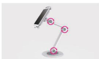
3 Pivoting Points Create flexible height and viewing angle adjustment.