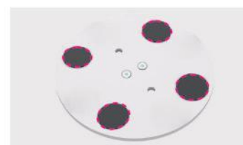
Anti-Slip Rubber Pads Prevent scratches to surfaces.