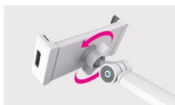
360° Rotation For placing your device in portrait or landscape position.